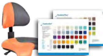
"Tundra skai" Page 108 "Pandoria Plus" Page 109

Standard colour anthracite Item No.: 3037 0052