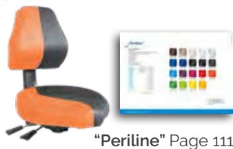
"Periline" Page 111

Standard colour black Item No.: 3037 0235